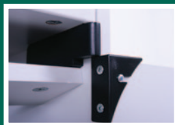
180 Degree nylon hinge for unobstructed collection