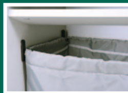
Nylon bag hooks makes bag fit tight. No paper misses the bag.