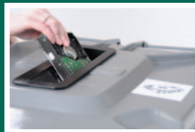
Hard drive cart with Lockjaw® lock and label (shown left)