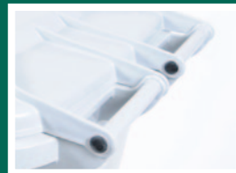
Handles allow for full control when moving cart