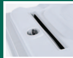
Lid with molded paper slot