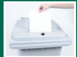
Provides secure collection of documents